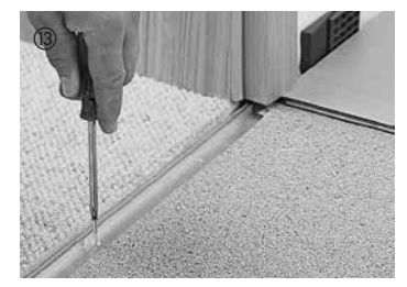
In doorways, mount a suitable moulding system to ensure the necessary expansion space. This also applies if the same floor is to be laid in the adjoining room. In this case, a transition moulding should be used for covering the required expansion gap.