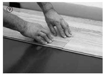
The board is then lowered in on the short side. Ensure here that the board is flush at the short side with the previously laid board. Pressure applied briefly to the side joint clicks in the board.