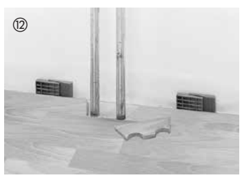
If radiator pipes protrude from the floor, drill or saw a cutout into the board (the size of the cutout depends on the radiator pipe and the required expansion space).