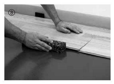
Tap edge gently with tapping block, if necessary.

The next row is started with the leftover piece of the first row (short side offset of at least 50 cm). This considerably reduces waste. The rest of the installation is performed boardby-board. First, the boards are angled into the previous row along the long side by applying a small amount of force.