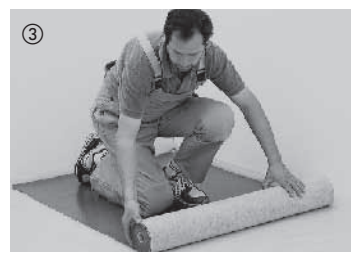
For sound insulation and to smooth out slight irregularities of the subfloor, unroll 2 mm thick luxury insulation layer. Our range of accessories also offers suitable insulation underlays. Asphalt-bitumen felt is not suitable for sound insulation. Parquet with integrated insulation layer is not suitable for glue-down installation.