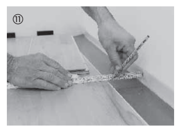
Cut to size and fit in the boards of the last row. Leave a gap of 10 to 15 mm between the boards and wall.