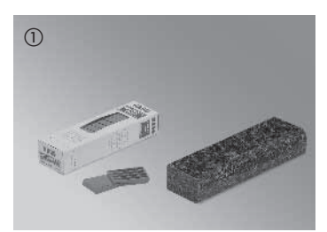
Installation tools: Tapping block, distance spacers, pencil, saw.