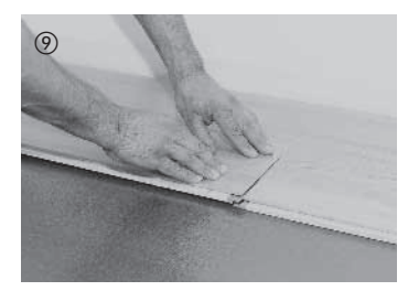
The board is then lowered in on the short side. Ensure here that the board is flush at the short side with the previously laid board. Pressure applied briefly to the side joint clicks in the board.