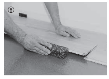
Tap edge gently with tapping block, if necessary.