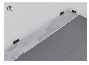
Starting in the right-hand corner of the room, align the boards of the first row with the tongue side parallel to the wall, and fix them in place with wall spacers or plastic spacers as you proceed (always keep an expansion gap of 10 - 15 mm (3/8 " – 1/2") around perimeter).